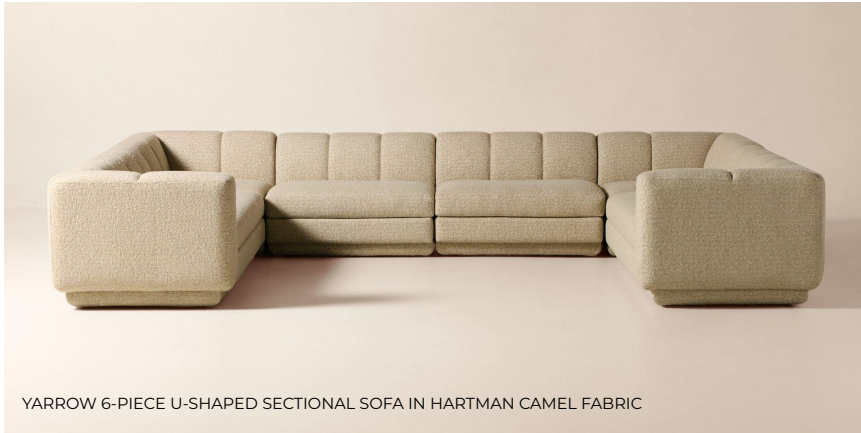
YARROW 6-PIECE U-SHAPED SECTIONAL SOFA IN HARTMAN CAMEL FABRIC