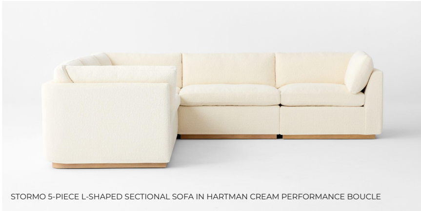
STORMO 5-PIECE L-SHAPED SECTIONAL SOFA IN HARTMAN CREAM PERFORMANCE BOUCLE