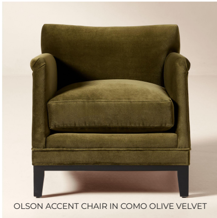
OLSON ACCENT CHAIR IN COMO OLIVE VELVET