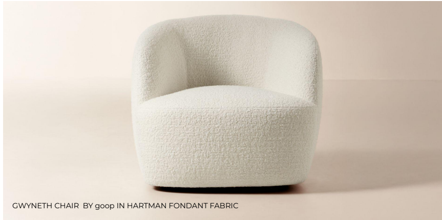
GWYNETH CHAIR BY goop IN HARTMAN FONDANT FABRIC