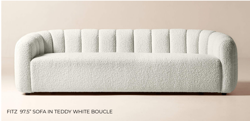
FITZ 97.5" SOFA IN TEDDY WHITE BOUCLE