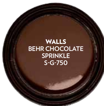
WALLS BEHR CHOCOLATE SPRINKLE S-G-750

>> Select sturdy upholstery that will stand up to kids and pets, like a straw-colored tweed, and brighten the scheme with vibrant pillows. “Orange looks great with brown and white and gives you that pop,” says Nye. Hometrends Pebbles Decorative Pillow , walmart.com , $13, and Hometrends Coconut Shell Decorative Pillow , walmart.com , $12