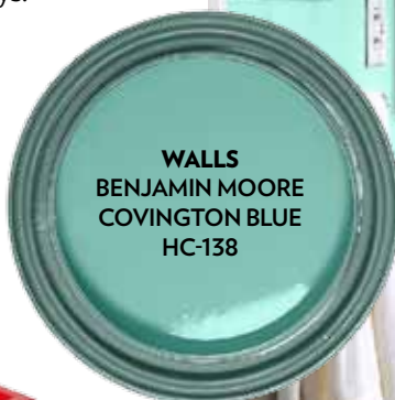
WALLS BENJAMIN MOORE COVINGTON BLUE HC-138

>> Extras—a bold patterned shower curtain or countertop accessories—in high-voltage reds, yellows or oranges heat up the cool hue. Red Lacquer Lotion Pump, $24, and Red Lacquer Soap Dish, $20, jonathanadler.com