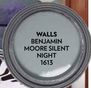
WALLS BENJAMIN MOORE SILENT NIGHT 1613