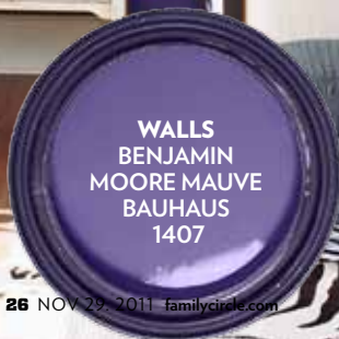
WALLS BENJAMIN MOORE MAUVE BAUHAUS 1407

Just for fun paint a flash of zingy color—a saturated pink like Benjamin Moore’s Newborn Pink—inside the closet.